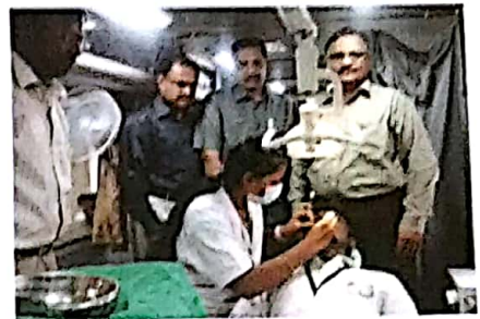
Doctor examines the student's tooth in the free dental camp