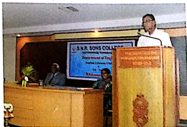
Flooding radiance of literary delight

A child miseducated is a child lost. – John F. Kennedy