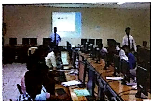
Learning Curve— Students in their workshop