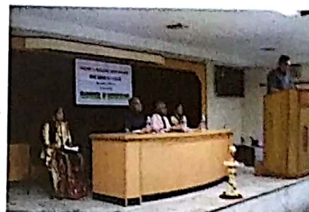
The Leader stands tall and unique