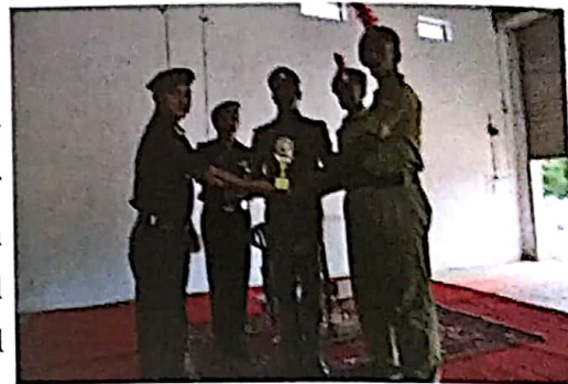
Our Cadets get sports award in AAC