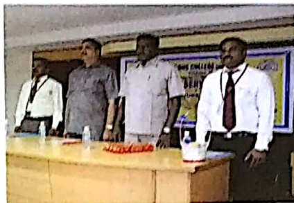
Standing up for a noble cause