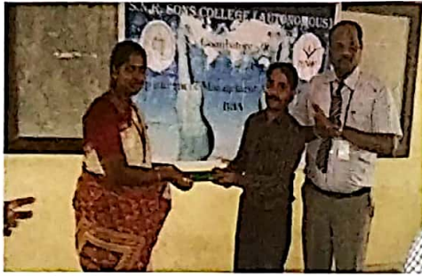
The chief guest honoured in the workshop