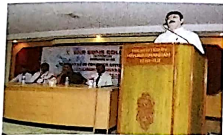
Simulating new horizons of virtual reality