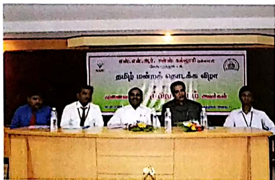
The confluence of Tamil enthusiasts