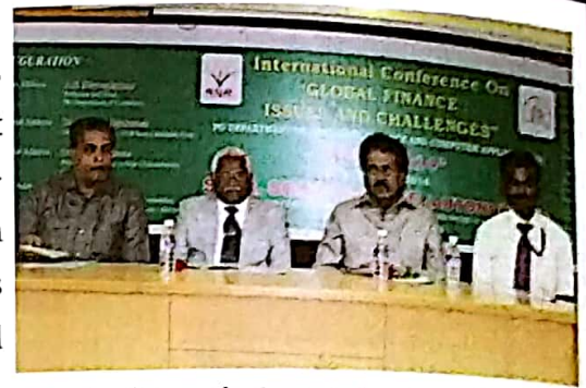
The Erudite at the International Conference