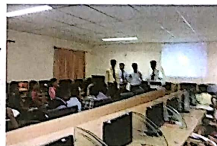
Students at Web design workshop