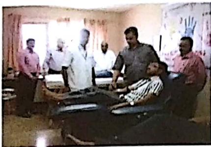
Students donating the blood