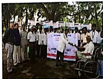
Kits distributed to heart patients