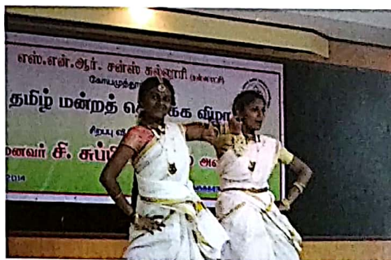
A classic tribute to the classic language