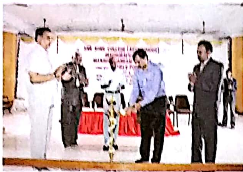
The Genius In yet another launch