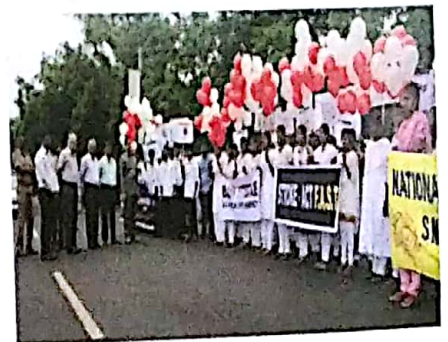
World Stroke day rally

Education is the best friend. An educated person is respected everywhere. Education beats the beauty and the youth. - Chanakya