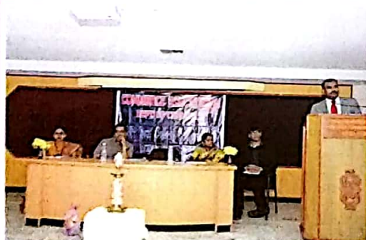
The learned enlightens the students