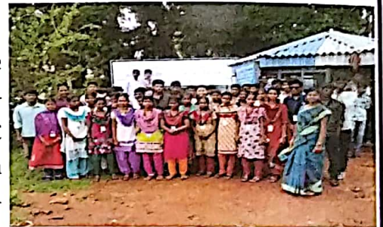
Students' at Aavin Milk, Pachapalayam

The Department of BBA CA organized various events in the odd semester of the academic year 2014-15. In order to comprehend industrial administration, the students visited the NTC Mills Ltd., a modernized textile plant at Mettupalayam Road, on 8 th August 2014. The students visited the Aavin Milk, Pachapalayam, Coimbatore, on 23 rd July 2014.