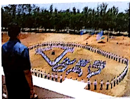
Students' human chain to mark NSS day