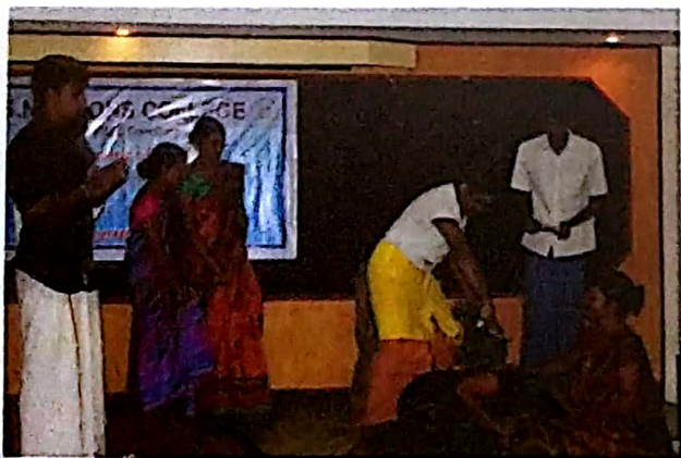
Students enacting the poem "Night of the Scorpion"