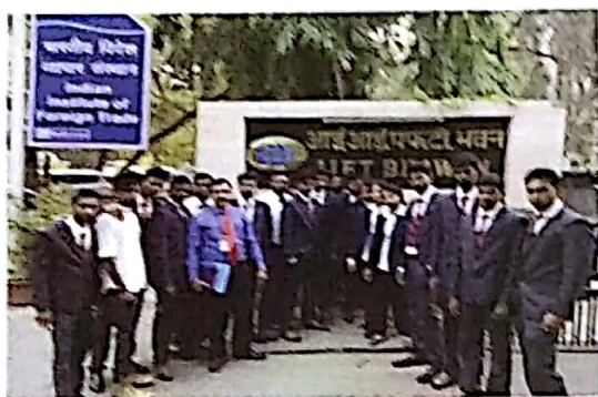
MIB students at Indian Institute of Foreign Trade

An "ORIENTATION AND TRANSITION" program was organized as a welcome for the new comers and transition for the present students of MIB from 8 th August 2014 to 14 th August 2014 with various sessions on self-confidence, values and ethics, career transition and skill development. MIB students visited Indian Institute of Foreign Trade, New Delhi on 20 th November 2014 as an educational tour which comprised of an interactive session with the Registrar, IIFT and access to the IIFT library.